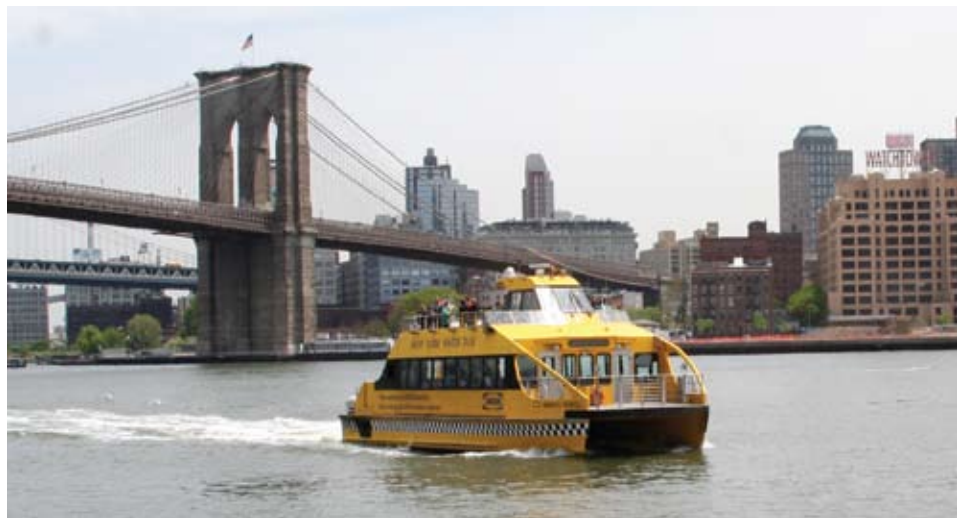
NYC Economic Development Corporation

Despite these concerns, recreational enjoyment of New York's waterways is a priority for the City. Creating new facilities in appropriate locations and configurations, and providing guidance and support to the boating community, will promote safe and healthy recreational use of the Blue Network.