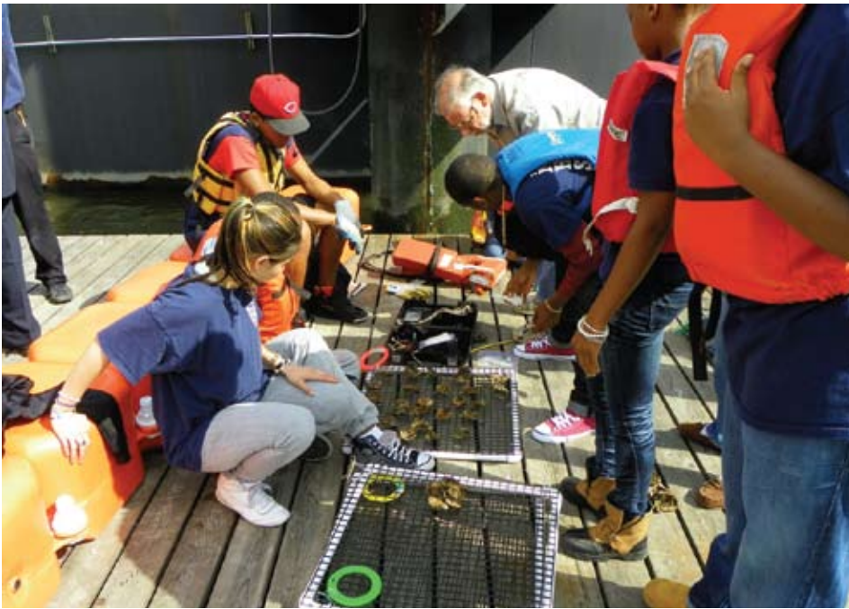
New York Harbor Foundation