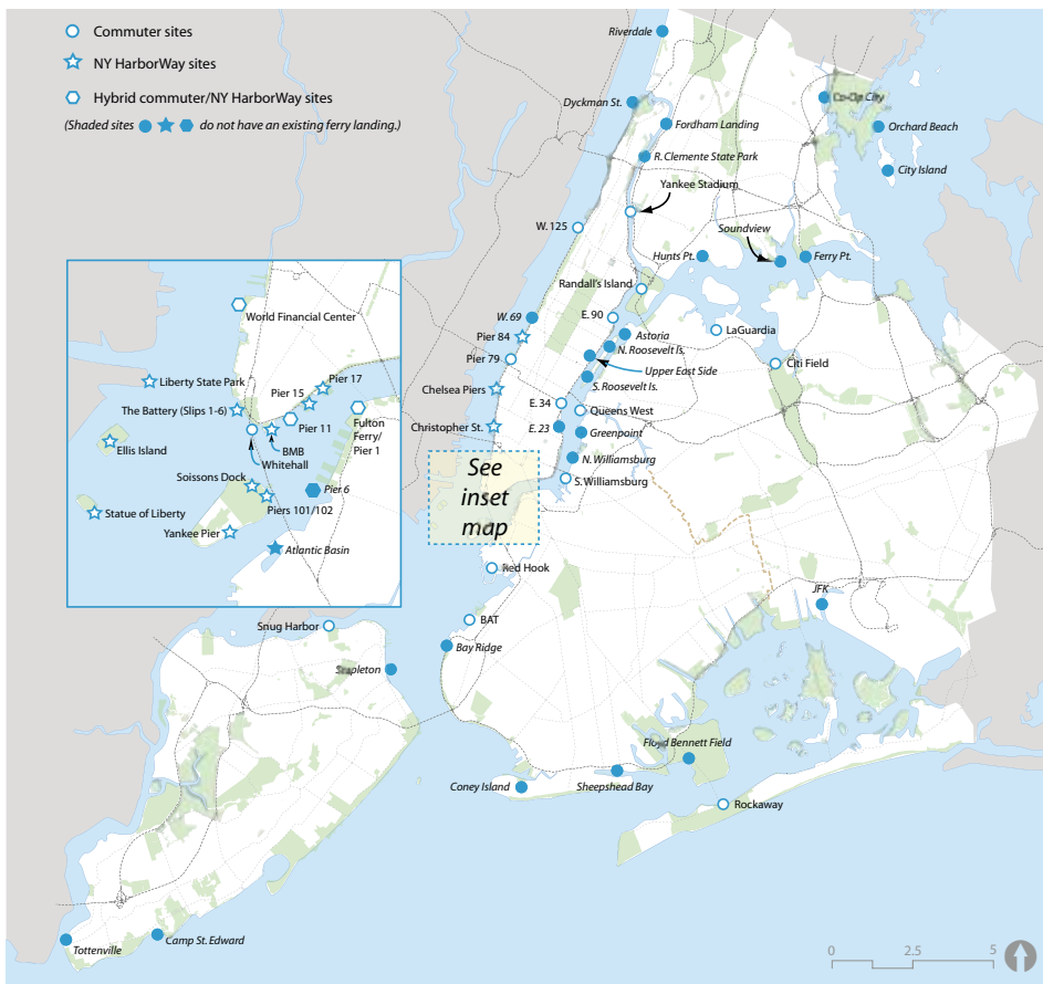
Figure 3: Sites evaluated in the Comprehensive Citywide Ferry Study.

ers, public-sector operating subsidies for private ferry services in the New York metropolitan region have been limited. The ferry study reviews a host of tax and revenue sources, including general tax sources such as the property tax, sales tax, and income tax; federal and state sources; and special district funding. No recommendations are specified, but decisions will need to be made with respect to long-term funding.