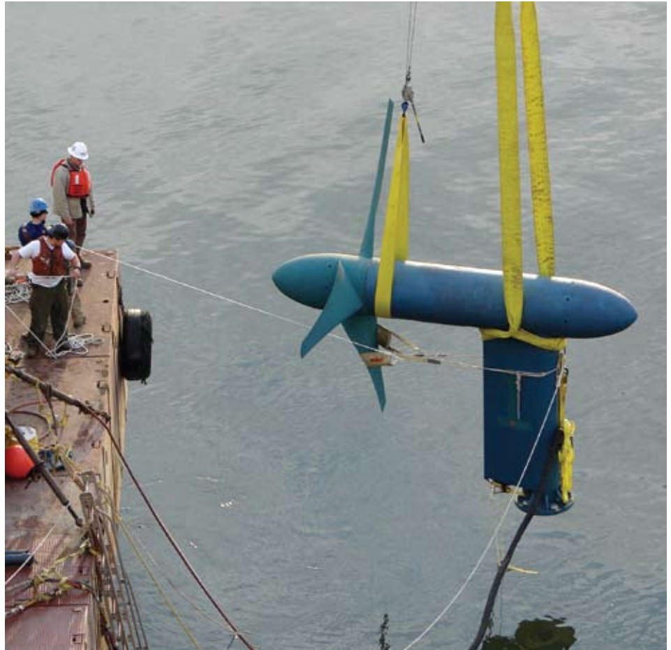
Installation of Verdant Power tidal turbines in the east channel of the East River.