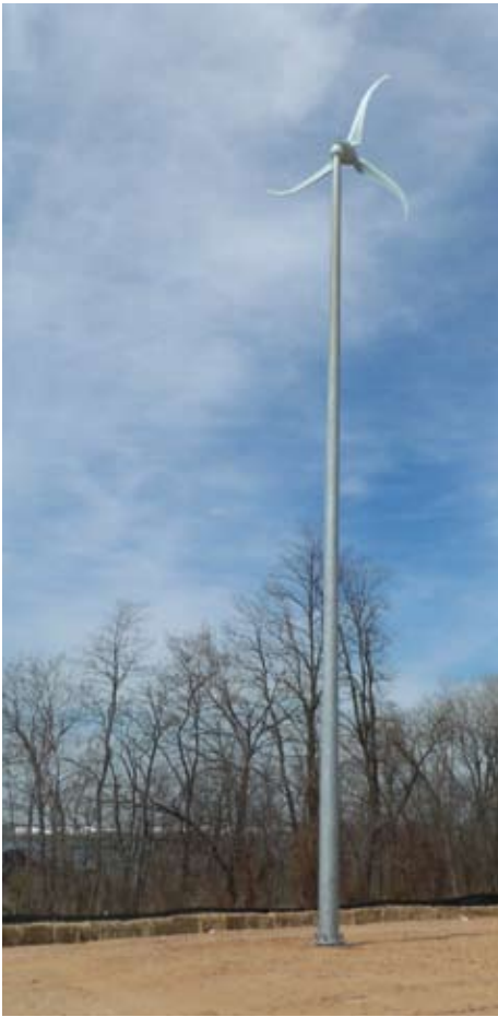
Wind turbine at the Tides at Charleston, Staten Island.