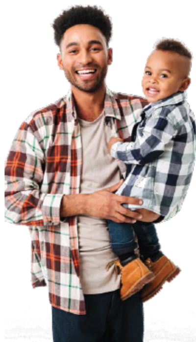
Photo for illustration purposes only. The people shown are models.