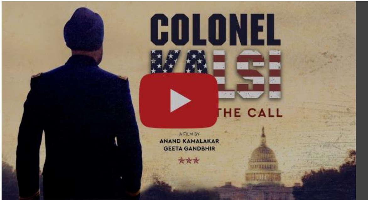
Trailer for Colonel Kalsi: Beyond The Call

The evening will begin with light refreshments, followed by opening remarks and the screening at 5 PM with a 1-on-1 Q&A with Dr. Kalsi at the film's conclusion.